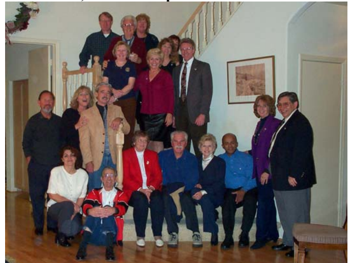
Rotary Clubs of Poway, Rancho Pensacitos, & Ramona Pre-meeting.

families. We then had an opportunity to visit our East County clubs of El Cajon, El Cajon Breakfast and Santee-Lakeside. Each of these clubs, like all the clubs in our district are doing a wonderful variety of projects and programs in their respective communities and also throughout the world. We changed the schedule every so slightly and completed the month of November with a visit to the Rotary Club of Encinitas to start off the Thanksgiving season. We did not hold a pre-meeting on Sunday the 24 th , and as you know the Charger lost that day. Sorry about that. We will complete the official visits for all the clubs during the month of December. As you know, we will then return to each club for a brief visit during the months of January and February to report on the status of the district, and the respective clubs.