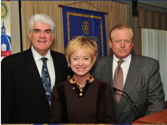
Pictured at left from top to bottom: