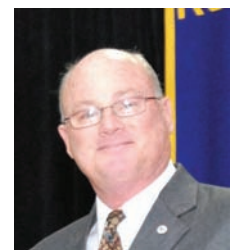
Chair of the Day