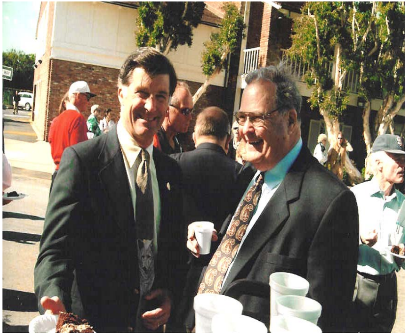
Coffee, cake and other goodies were available afterwards for the members and their guests.