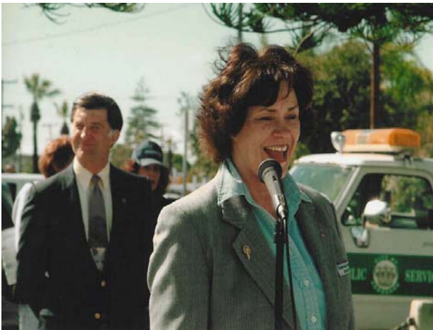
District Governor Rimer also participated in the ceremony.