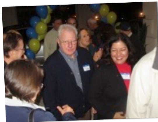
Congratulations Rotarians on the Success of District Governor Event!