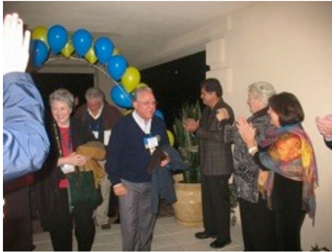
District Governors greeted by fellow Rotarians red carpet style!